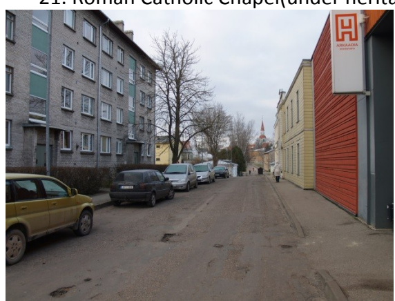
22. Apartment house on Sõpruse Str.