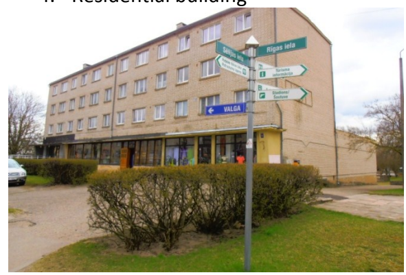
5. Mixed use building