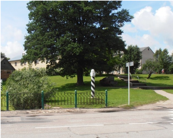
3. "400 Years of Valga-Valka" memorial