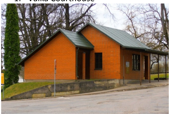
2. Former Border Checkpoint