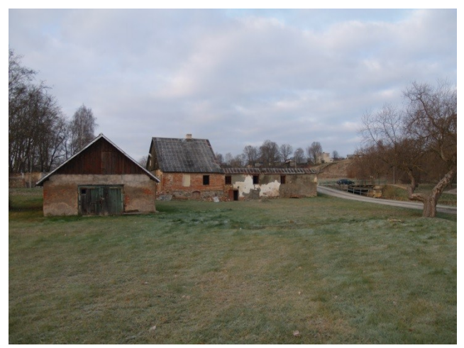
24. Former Ramsi Watermill(under heritage protection)