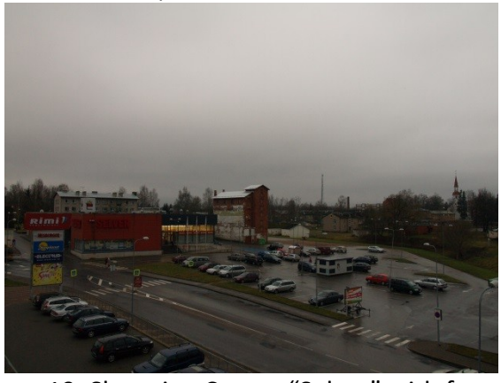
19. Shopping Centre "Selver" with former Winery tower (view from "Rimi" roof)