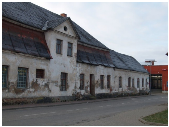
16. Former County (Kreis) Authority Building(under heritage protection)