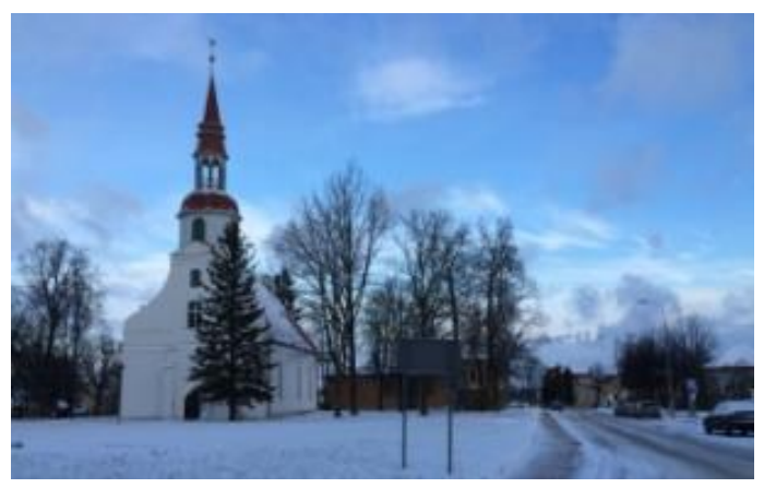
9. Valka Lugaži Church (under heritage protection)