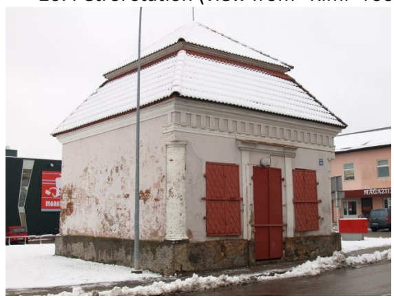
21. Roman Catholic Chapel(under heritage protection)