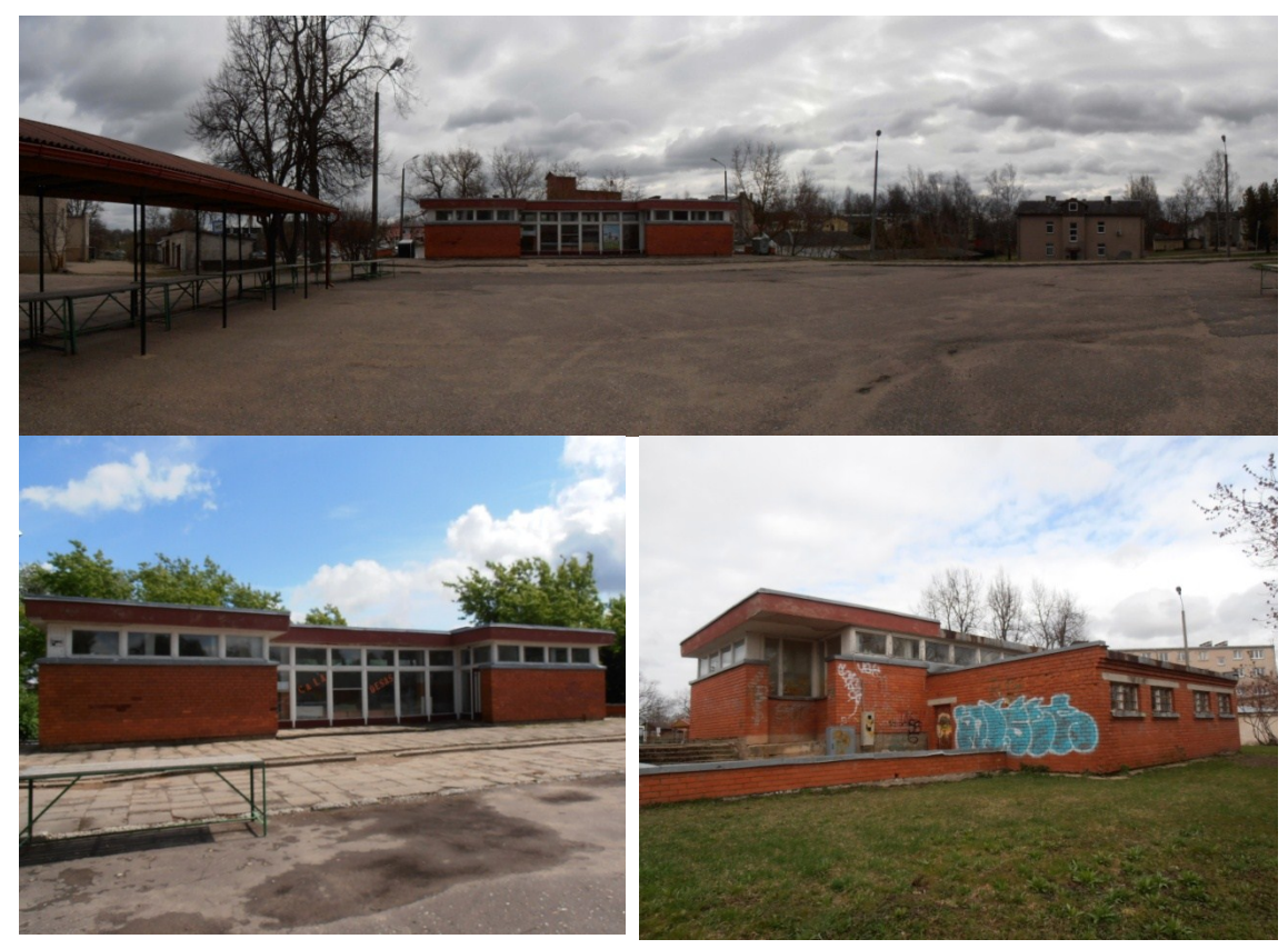
7. Underused market pavilion