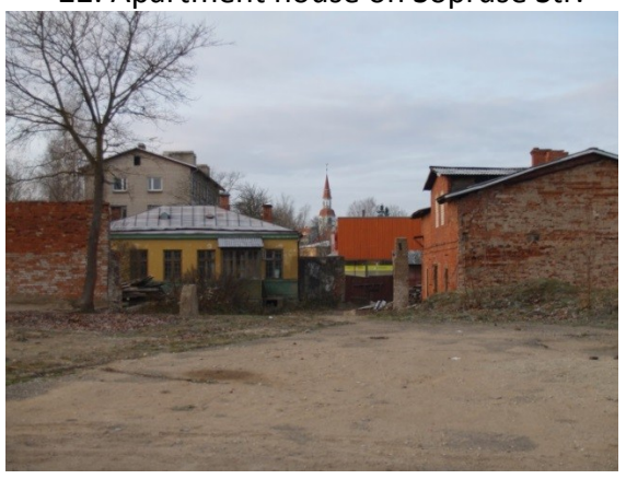
23. Valga historical centre with the view to Lugaži Church tower