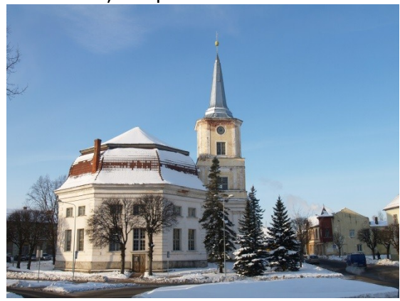
15. Valga Jaani Church(under heritage protection)