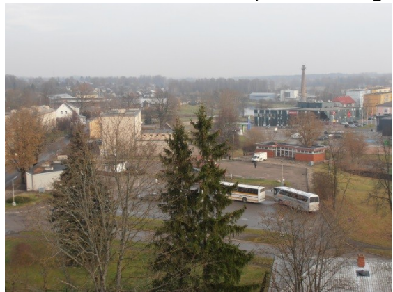
18. Bus station, market and shopping Centre "Rimi" (view from Lugaži Church tower)