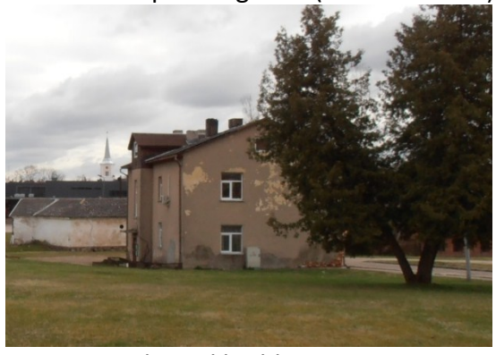
12. Residential building