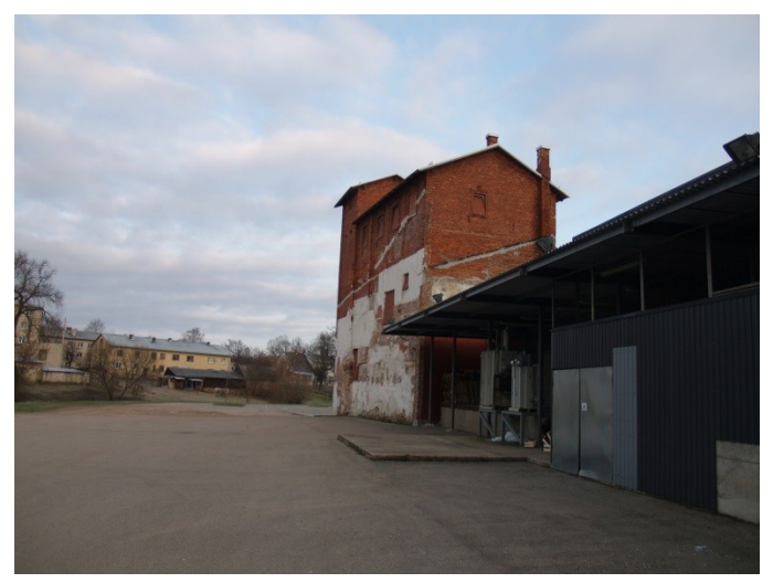
13. Old Winery tower