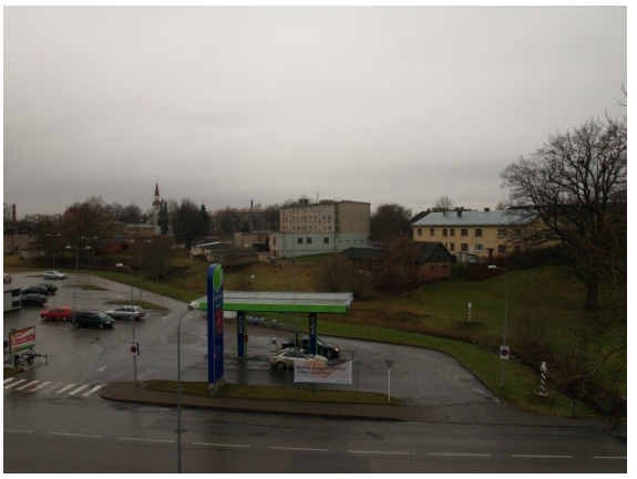
20. Petrol station (view from "Rimi" roof)