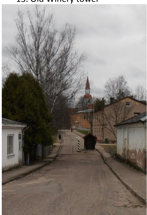
14. Raiņa-Sõpruse Str.