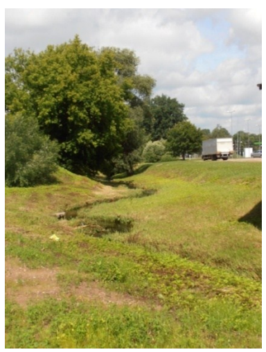
27. Varžupīte-Konnaoja Creek

For photos in full resolution see Appendix IV: Photos of important objects in competition area or its surroundings.