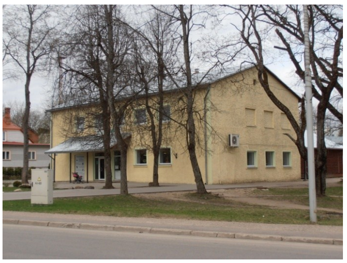
8. Bistro and hotel "Jumis"