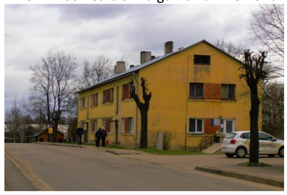
4. Residential building