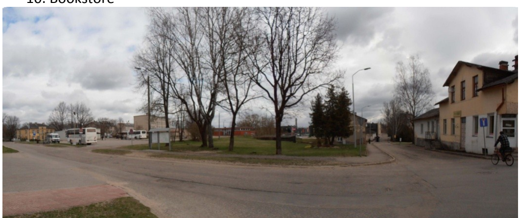
11. Bus operating area (view from Raina and Latgales street crossing)