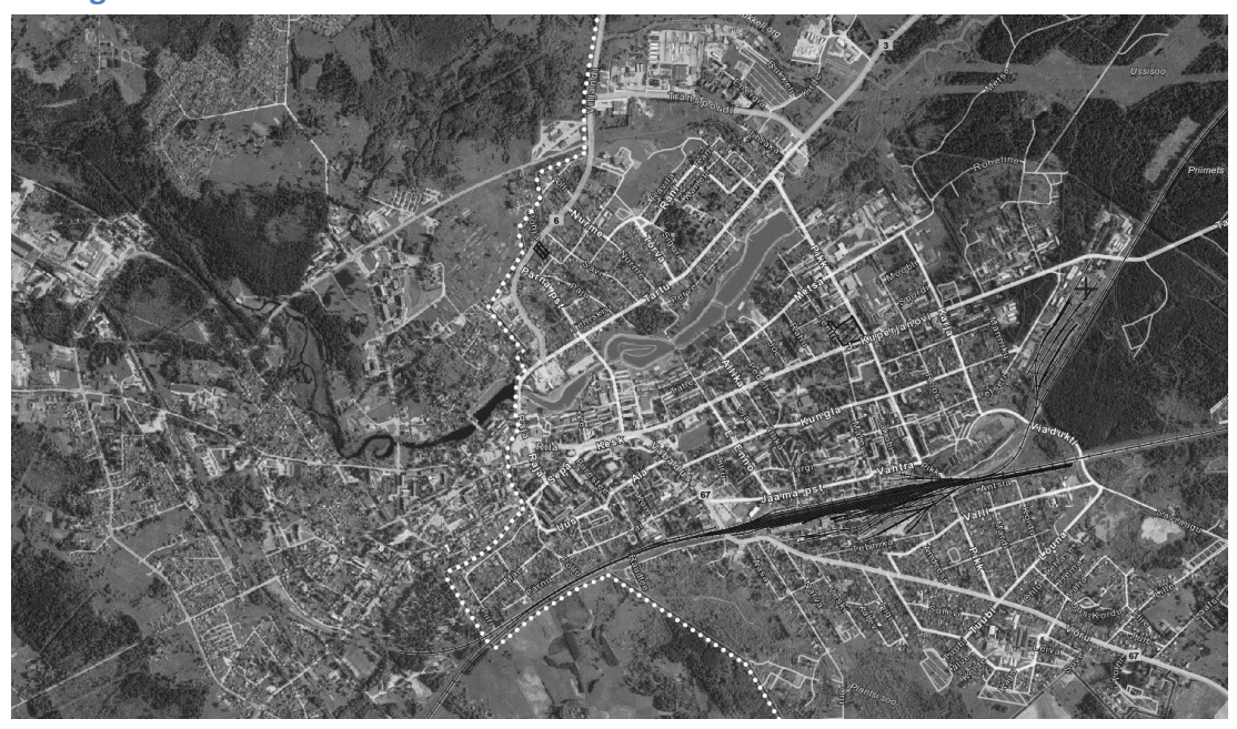
Valga-Valka orthophoto, Source: Estonian Land Board, 2015

For photos in full resolution see Appendix II: Ortho photo of competition area.